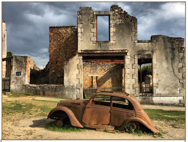
Historical Sites: Visit Oradoursur- Glane and discover its story (15 min.)

Porcelain: Museums, factories and shops are at our doorstep (10 min.)