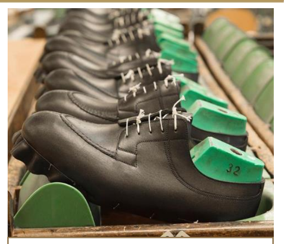
<u> Craftsmanship: </u> Leather and glove-making factories (20 min.)